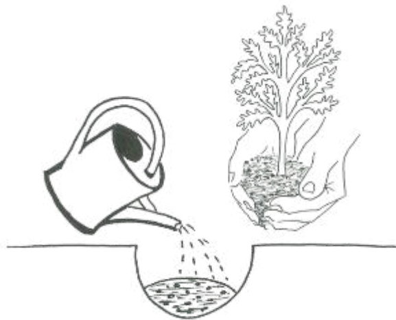
Figure 2 : transplanting an Artemisia seedling (Agathe Cornet-Vernet)

The doses to be applied are the same as those traditionally used in market gardening. The staggered application of 1 kg of poultry manure compost per plant gives very good results. It is essential to adapt the type of manure taking into account the specific growing conditions of the region: soil type, climate, possible irrigation. Nitrogen appears to be the determining nutrient in the growth of Artemisia annua . [2]