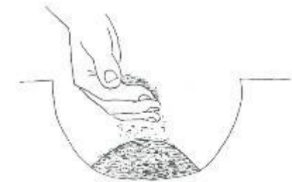
Figure 1 : handful of compost added to hole prior to transplanting (Agathe Cornet-Vernet)